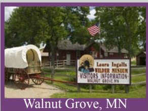
Walnut Grove, MN

You will experience her insight and her love for her family.