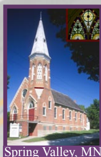
Spring Valley, MN